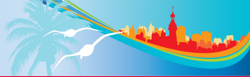
EXHIBIT BOOTH SALES